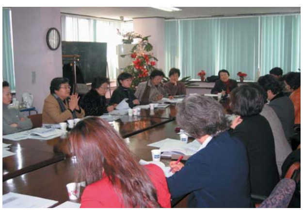
Nursing Policy Forum held every month

Key services include: researches on nursing policies conducted to promote national health and development of the policy, collection of the information on nursing related health policies, analysis on policy trends, international exchange and education support, collaborative researches with and support for the research establishments designated by the association, and outsourcing of research projects.