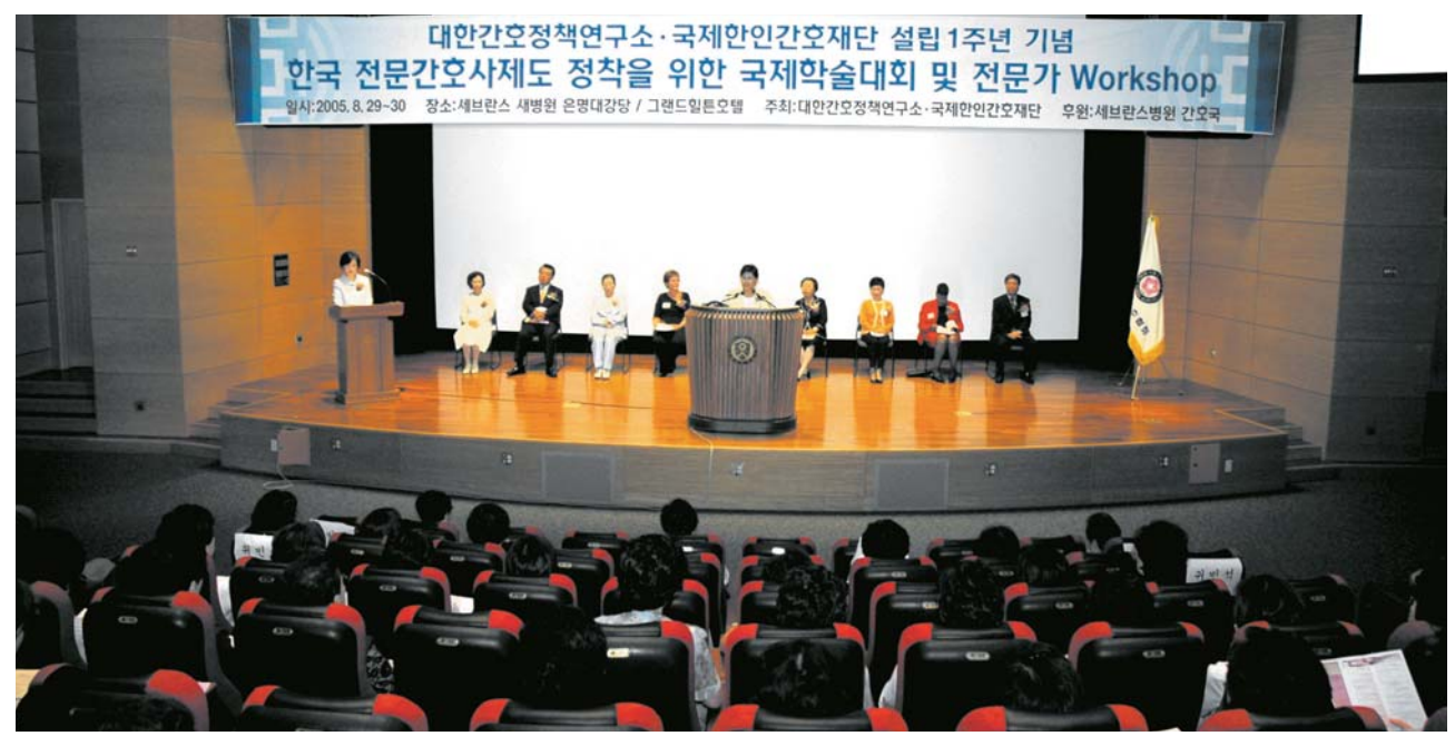
Opening Ceremony of GKNF International Scientific Conference