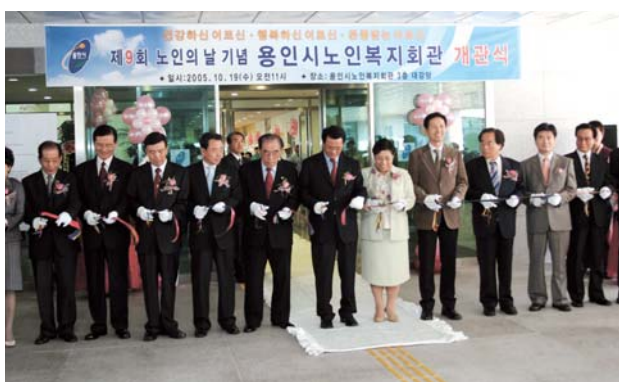
Tape cutting to celebrate the opening of Yongin Senior Citizen Welfare Center

KNWF operates affiliated facilities like the Day Care Center