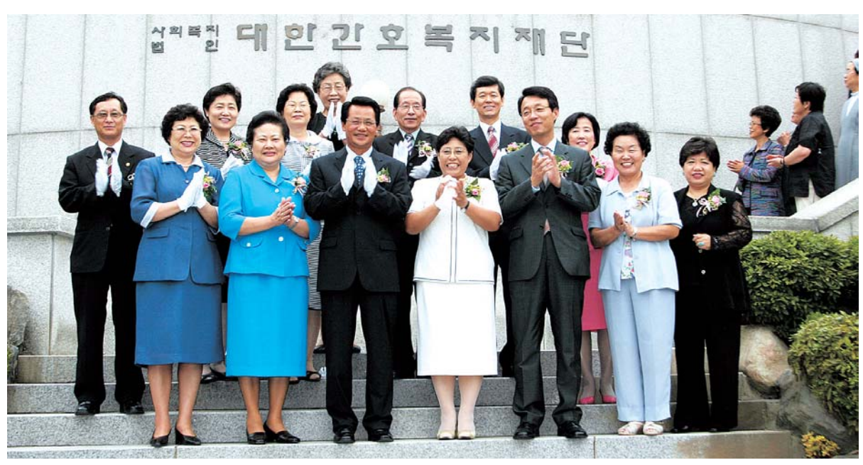
Taking commemorational photo to celebrate the foundation of the KNWF

The Korean Nurses Welfare Foundation (KNWF) was founded as a social welfare foundation in January 2004 to provide various services through interdisciplinary team approach.